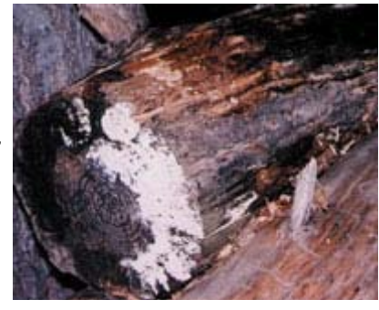
Mold growing outdoors on firewood

Molds are part of the natural environment. Outdoors, molds play a part in nature by breaking down dead organic matter such as fallen leaves and dead trees, but indoors, mold growth should be avoided. Molds reproduce by means of tiny spores; the spores are invisible to the naked eye and float through outdoor and indoor air. Mold may begin growing indoors when mold spores land on surfaces that are wet. There are many types of mold, and none of them will grow without water or moisture.